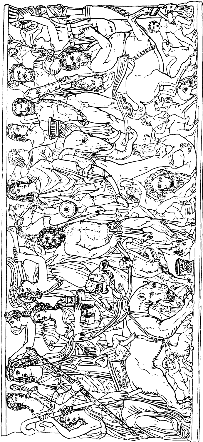
‘Onward the tiger and the leopard pants With Asian elephants’

FROM A SARCOPHAGUS RELIEF AT WOBURN ABBEY